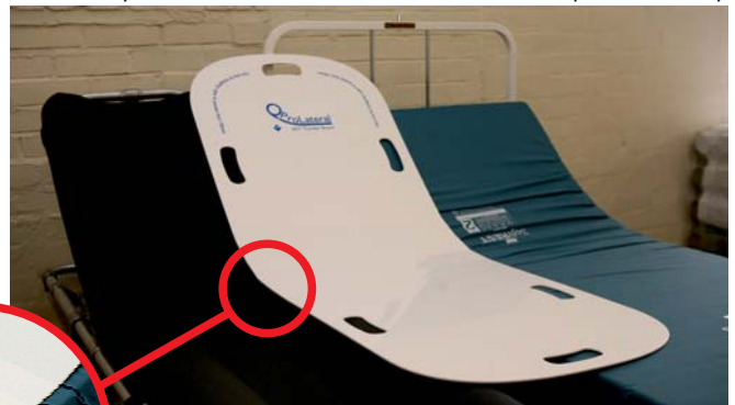
QProLat-AET Size 1500mm Long x 590mm Wide x 4.5 mm Thick

The QProLateral is designed to bridge the gap between two hospital beds. It is wider than a Patslide and provides more of a transfer surface with today's wider hospital beds. It is lightweight, weighing less than 4.5kg and is used either flat like a Patslide TM or curved to allow transfers between profiling beds or trolleys.