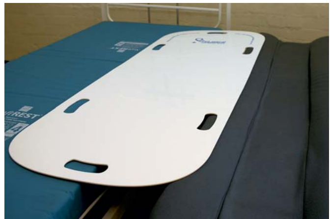
Qlatslide-AET Size 1500mm Long x 590mm Wide x 4.5 mm Thick